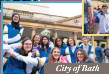
City of Bath