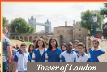
Tower of London