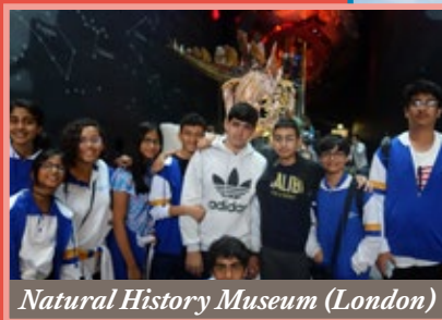
Natural History Museum (London)