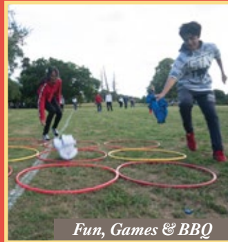
Fun, Games & BBQ