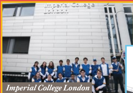
Imperial College London