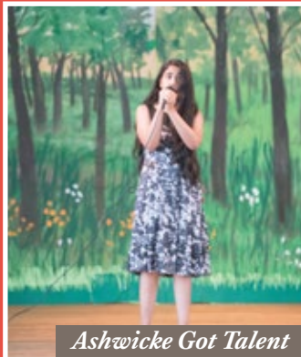
Ashwicke Got Talent