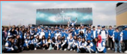
Warner Bros. Studio Tour London - The Making of Harry Potter